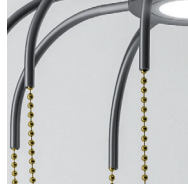
anthracite grey wrinkled / chains: natural brass